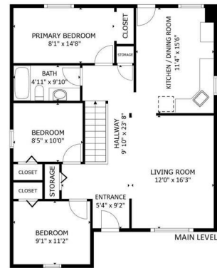
88 Castlebrook Rise NE - Calgary MAIN LEVEL: 1053 SqFt